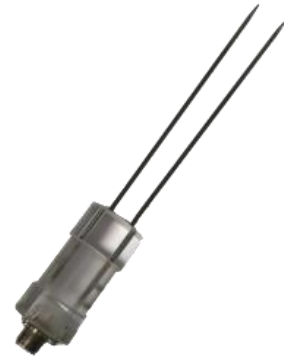
(code: HF3) 20 mm needle probe for bales