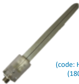
(code: HF7) Dagger probe (180mm) for folds