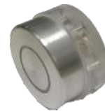
(code: HF6) Pad probe for non-moving fabrics