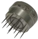
(code: HF4) Needle pad probe for beams