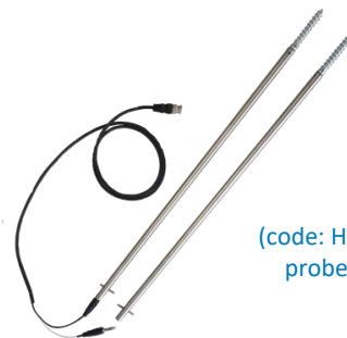
(code: HF9) 500 mm Needle probe for packed bales

“ Other kinds of probe available on demand “