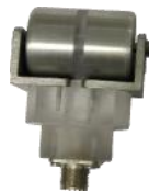
(code: HF5) Roller probe for moving fabrics